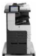
HP LaserJet Enterprise MFP M725z+