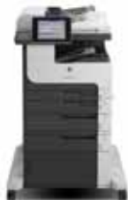
HP LaserJet Enterprise MFP M725f