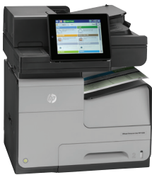
HP Officejet Enterprise Color MFP X585dn

A printing revolution for business. HP Officejet Enterprise MFPs deliver colour prints at up to twice the speed and half the cost per page of colour lasers plus copy, scan, and fax. 1,2,8 They're designed for advanced workflow—and built to last.