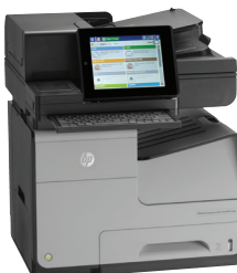
HP Officejet Enterprise Color Flow MFP X585z